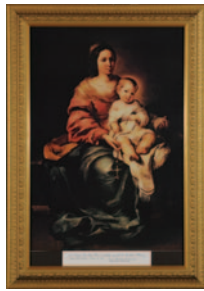
2002-03 Our Lady of the Rosary