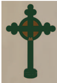
1999-2000 Millennium Cross