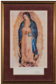
1995-96 Our Lady of Guadalupe