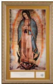
2011-13 Our Lady of Guadalupe