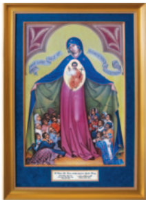
2018-20 Our Lady Help of Persecuted Christians