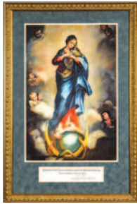
2013-14 Immaculate Conception