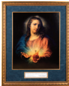
2025- Sacred Heart of Jesus