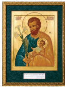
2021-24 St. Joseph