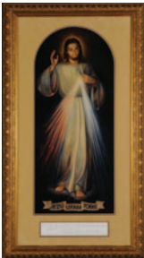
2003-04 Divine Mercy