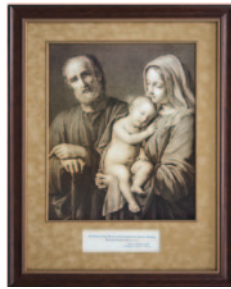
2015-17 Holy Family