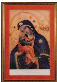
1988-89 Our Lady of Pochaiv