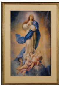
1981-82 Immaculate Conception