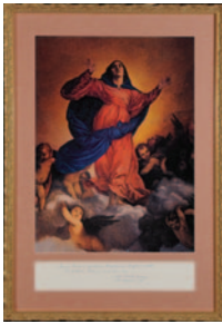
1990-91 Our Lady of the Assumption