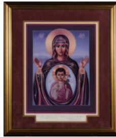
1997-98 Our Lady of the New Advent