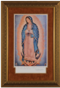
2000-01 Our Lady of Guadalupe