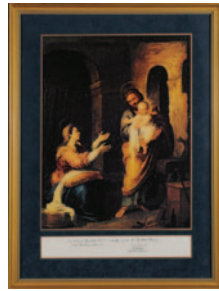
1993-94 Holy Family