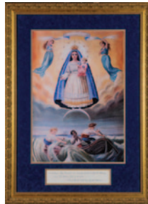
2007-08 Our Lady of Charity