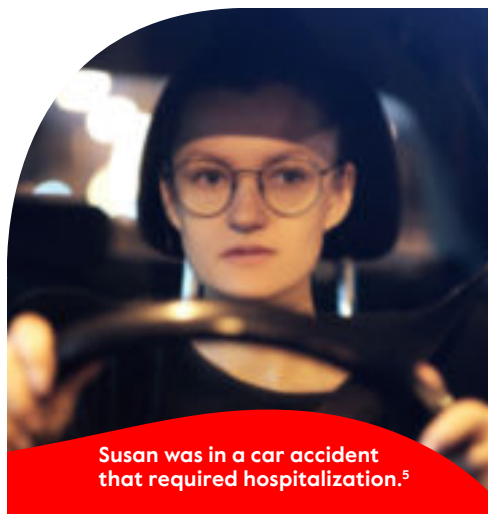
Susan was in a car accident that required hospitalization. 5