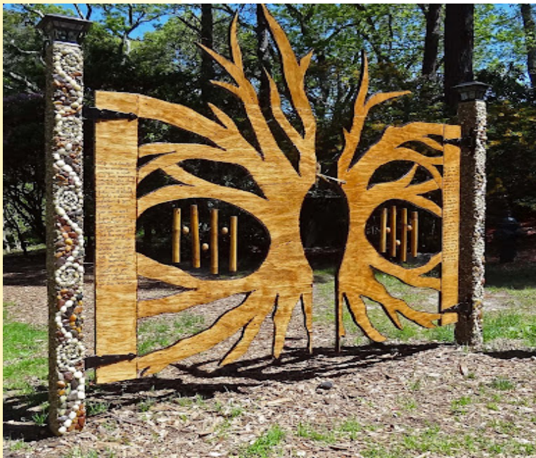
Whimsical Gates, Heritage Museums and Gardens Sandwich, Massachusetts, USA