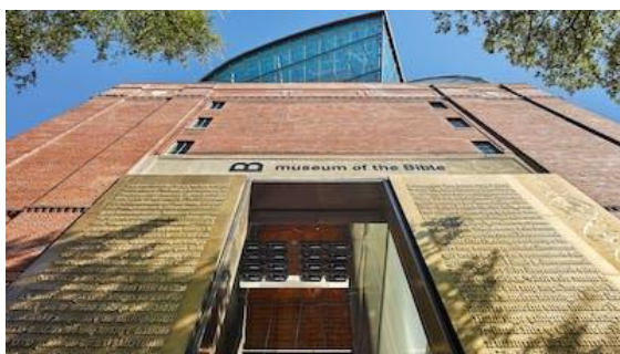
Museum of the Bible.