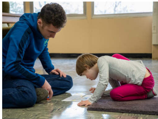
High school students are among the volunteers at the Catholic Community of Ascension and St. Augustine who support faith formation programs for children with special needs.

I truly believe that Pope Francis is a breath of fresh air for the church. I had the opportunity to