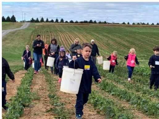
Volunteers harvest vegetables at First Fruits Farm in Freeland to be distributed to local food banks.