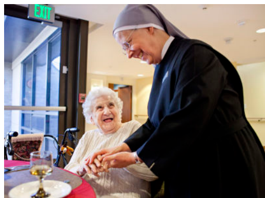
The Little Sisters of the Poor serve the elderly at St. Martin's Home for the Aged in Catonsville.

Our Lady of the Fields Roman Catholic Church joyfully celebrates the 50th Anniversary of the Priestly Ordination of Pope Francis and salutes the Pope for his priority in promoting the sanctity of all life. The parish is happy to share Pope Francis' vision as the People of God helping the not-yet-born and their mothers and fathers through the spiritual, physical, monetary and advocacy Respect Life Program. Through the Breaking Bread with the Hungry Program, the homeless and the poor are fed and hygiene and basic supplies are distributed. The parishioners also give shelter to the homeless through the Winter Relief Program