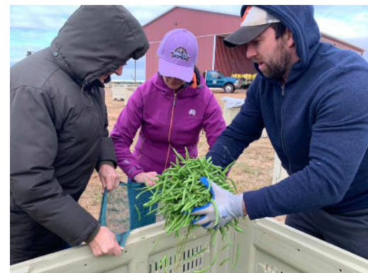
Volunteers harvest vegetables at First Fruits Farm in Freeland to be distributed to local food banks.

Pope Francis encyclical, “Laudato Si’,” “On Care for our Common Home” created a spiritual and moral compass for how facilities and real estate is to lead in the management of our buildings and