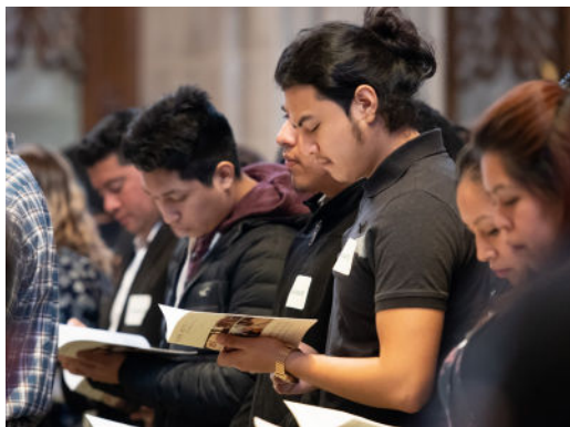
People being received in the Catholic Church participate in the Rite of Election May 11, 2019 at the Cathedral of Mary Our Queen in Baltimore.

The Mason-Dixon Council #10100 Knights of Columbus in Pylesville, Maryland, strives through our Faith in Action programs and events, to build a better understanding of the New Evangelization by inclusive and welcoming activities for