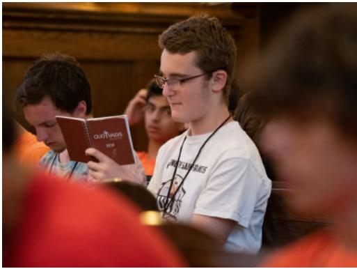
High school students from the Archdiocese of Baltimore participate in evening prayers July 25, 2019, during the Quo Vadis retreat at Mount St. Mary's Seminary in Emmitsburg.

reading St. John's gospels. Here is a priest who celebrates Mass amidst a stubborn cold, who drives a beat-up car to hospitals and homes of the elderly, high school graduations, funerals and priestly ordinations. Here is a friend who uses his allowance to quietly donate to his parish school and runs marathons for charity. Here is your brother, Your Holiness, intent on making God's grace available to all. May you be blessed knowing that this brother priest of yours humbly, humbly, answers his calling, and faithfully prayers for your intentions.