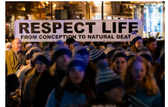
Mount de Sales Academy students wearing blue and white hats are among the voices being heard at the May 4, 2019 Maryland March for Life rally in the state capital of Annapolis.

Each Monday evening, prior to the 7:30 p.m., we