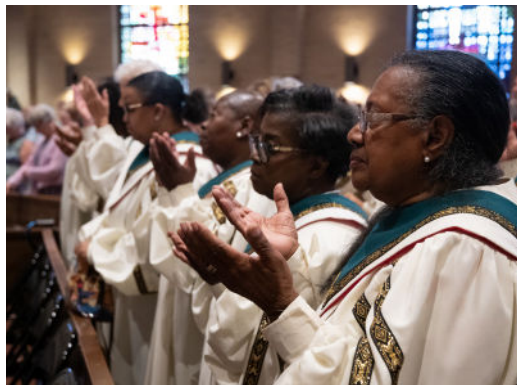
A choir sings during an July 28 Mass at St. Joseph in Fullerton.