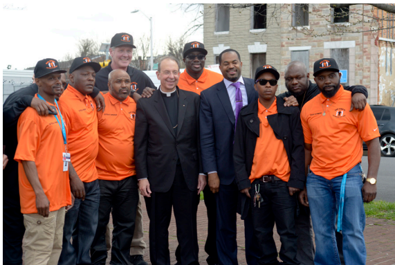
VIOLENCE INTERRUPTION: 515 incidents intervened by Safe Streets, Sandtown-Winchester