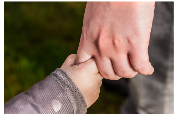
UNACCOMPANIED MINORS REUNITED: 571