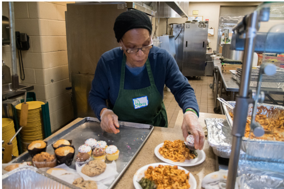
MEALS FOR THE HUNGRY: 534,128

7,852 | VOLUNTEER SERVICE TO CATHOLIC CHARITIES PROGRAMS (203,980 HOURS)