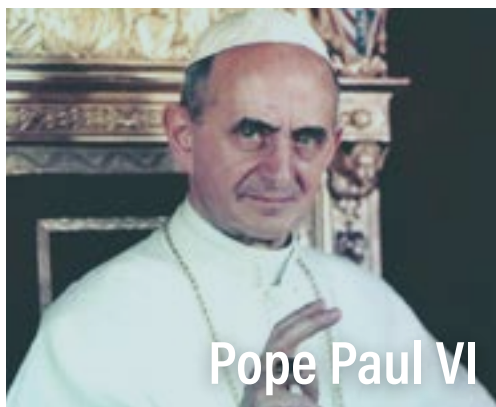
Pope Paul VI