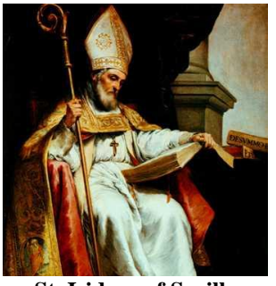
St. Isidore of Seville

Like the Tower of Babel, in what ways have I seen people separate their relationship with God from their use of technology to communicate? How have I seen people fail to act as a disciple while online, texting, calling or e-mailing others? How does that effect other people?